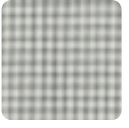
Check Steel Malt PMS COOL GRAY 7C